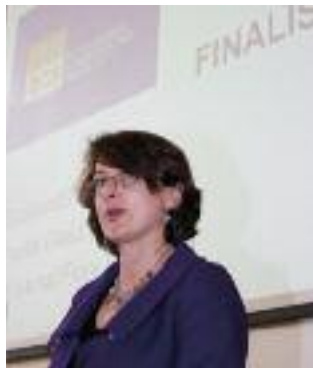
2010 Business Awards

The Scottish Borders is an area made famous by textiles and knitwear manufacture. It has a track record of providing employers with a highly skilled and loyal workforce. Our labour market continues to respond to the needs of our businesses and we ensure that they have access to the expertise they need – from pre-employment training to workforce development across a range of companies and sectors including Food and Drink, Pharmaceuticals, Software and E-Business, Tourism and Leisure and Textiles.